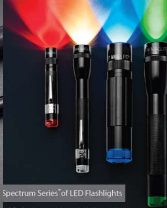
Spectrum Series™ of LED Flashlights